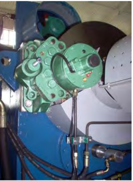
Brakes on high speed shaft