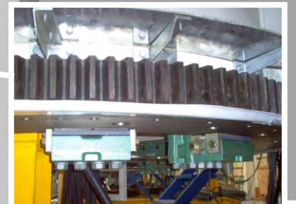
Brakes on YAW motion